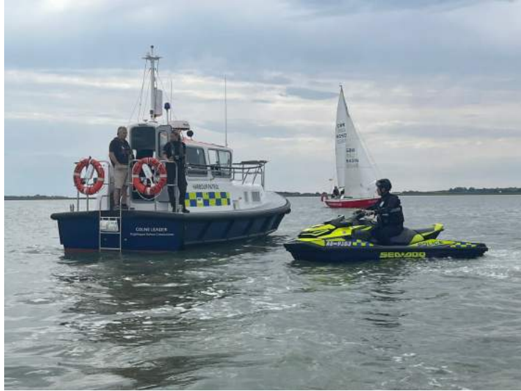
Operation Wave Breaker patrols to tackle ASB continued this year. This included joint patrols with the Brightlingsea Harbour Master