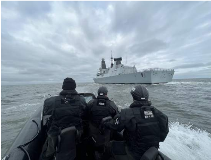
We were tasked to provide an escort for HMS Diamond as she passed along our coastline and up the River Thames for the King's Coronation