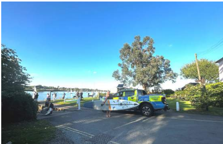
Throughout the summer PC Rawson has been conducting early evening patrols at Hullbridge to deter ASB on the River Crouch