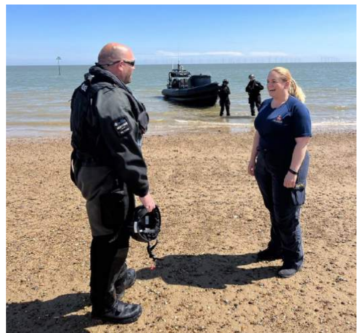
We have excellent links with our local HM Coastguard Teams and have worked with the Clacton team on a recent multi-agency exercise.