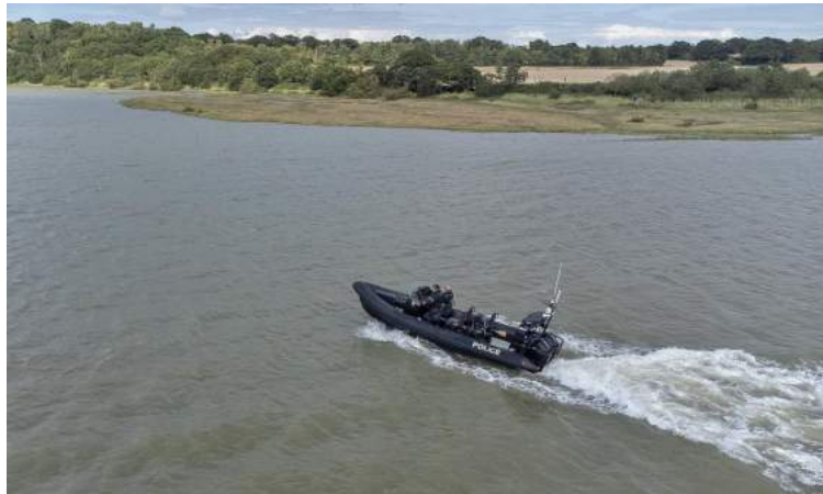
Our RHIB Sentinel out on patrol on the River Colne