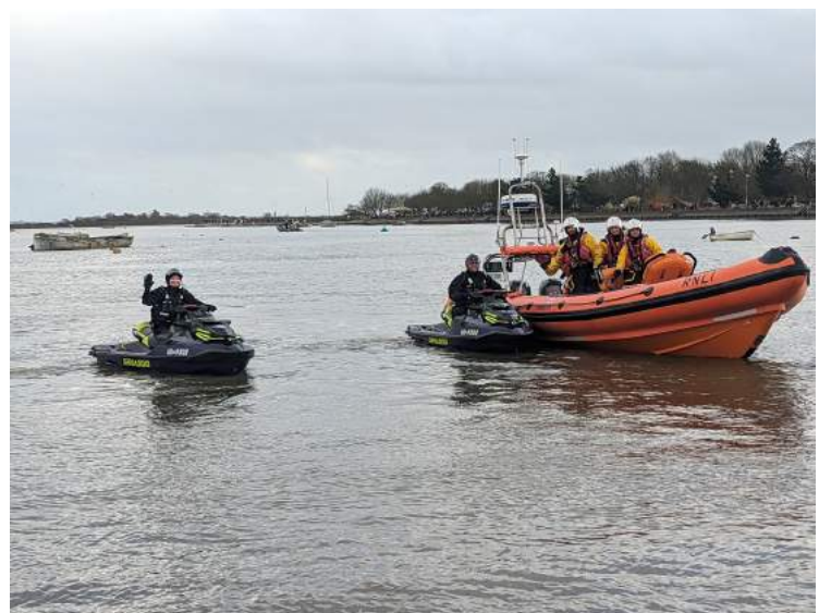
Working with West Mersea RNLI at Maldon