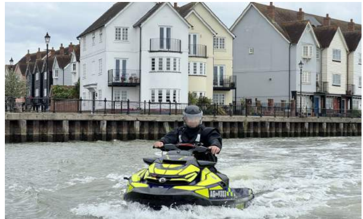
Out on the Maldon District Council PWCs, patrolling the River Blackwater