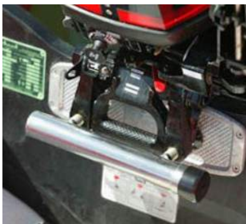
A simple lock can deter thieves

As always, please report any suspicious behaviour or anything that doesn't look right to 101 or our do-it-online portal.