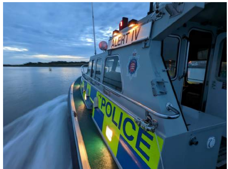
Returning home to Burnham at dusk in 2022