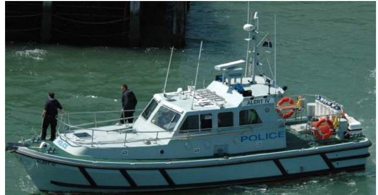
Alert IV in 2005 shortly after she joined Essex Police

We are in the process of identifying a replacement vessel (Cabin RHIB) and will update you with further details when we are able to.