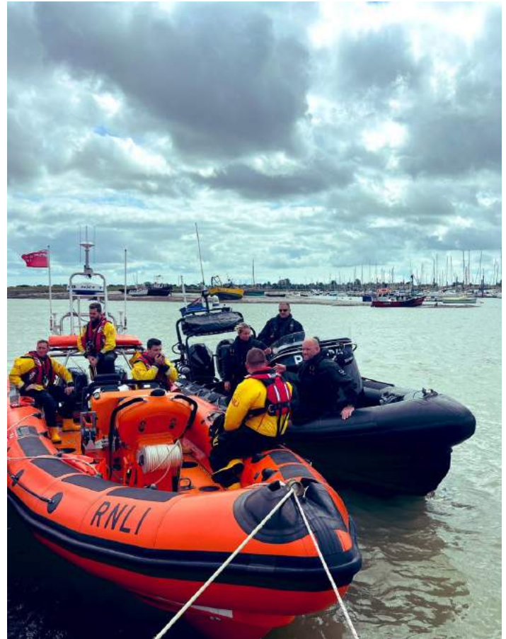
The poor weather led to a low turnout for the Brightlingsea Regatta but it didn't stop us attending with our colleagues from Clacton RNLI