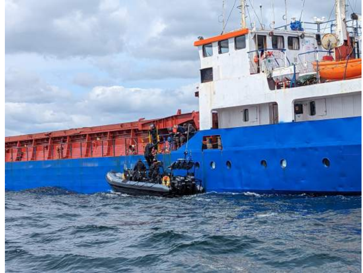
Boarding ships entering the River Thames alongside our colleagues from Border Force