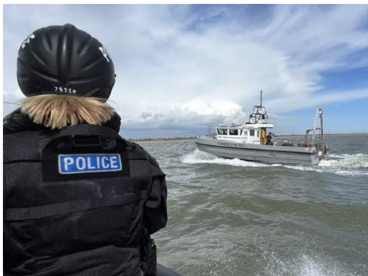
Joint patrols with Kent & Essex Inshore Fisheries